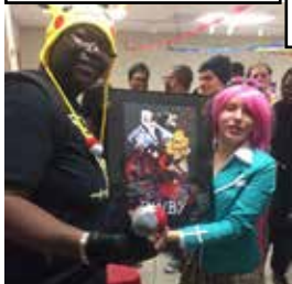
Raffle winner. Prize: RVBY poster signed by creators.