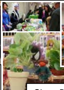
Ghost Poke'Mon Scavenger Hunt