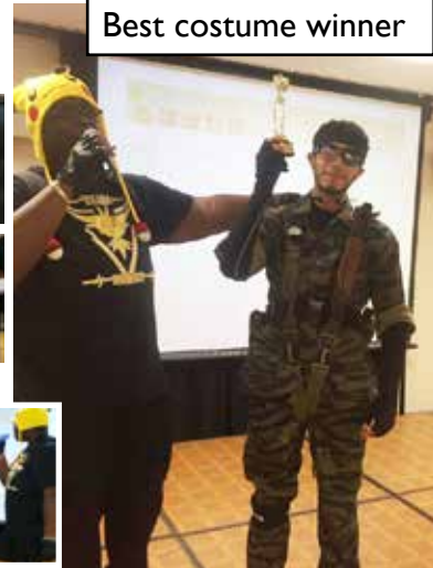
Best costume winner