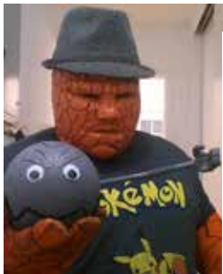
Stclair Cosplay Costume Contest Judge

PICTURE HIGHLIGHTS FRIDAY, OCTOBER 28, 2016