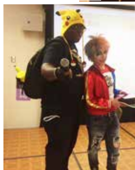
Funniest costume winner